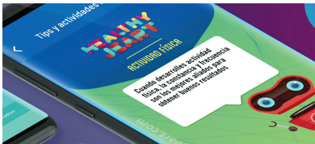
Figure 4 Game tips.

The challenges. Finally, the challenges section allows interaction and competition with other users of the application. The challenges are therefore group. Teachers of the educational centers are the responsible who must register to participate as a group-class or as a center. An example of a challenge would be: "For a week, do 5 minutes of relaxation exercises through breathing when you return from lunch." Teachers must report on its development. Administrators will certify participation and reward the winner group.